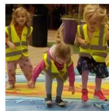
CHARACTERISTICS OF EFFECTIVE LEARNING (linked to C of EL Guidance)