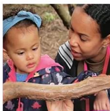
SUPPORT WELLBEING (linked to 5 Ways to Well being)

These staff meeting presentations are all FREE for Bristol Early Years Providers – settings will need the password from their lead teacher to be able to download the session required. Your lead teacher can also come to your setting to deliver a staff meeting by request. So, do get in contact and take a look. Watch the introductory Video here