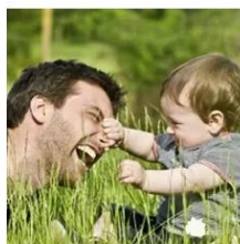
AN INTRODUCTION TO FIVE TO THRIVE (linked to Webinars coming soon)