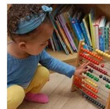
SETTINGS CURRICULUM (linked to Curriculum Toolkit)